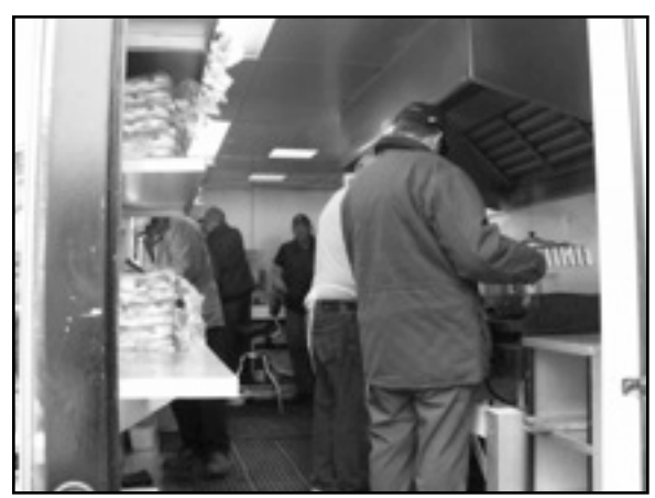
The cooking team commence!