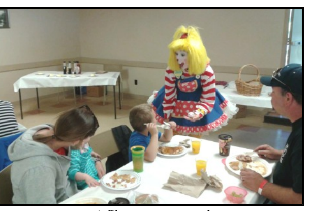
A Clown participated