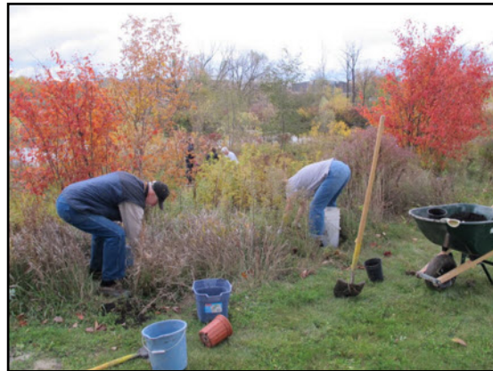
A strong back is essential