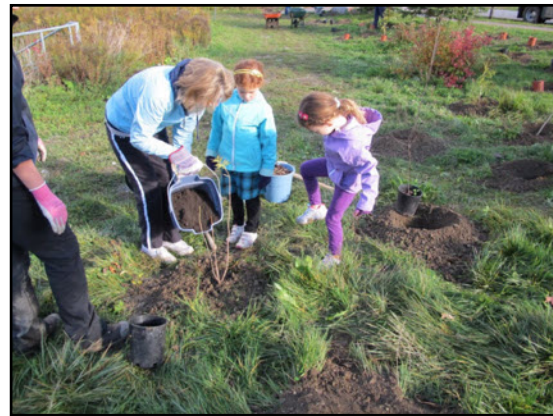
Good to see the kids participating as well!